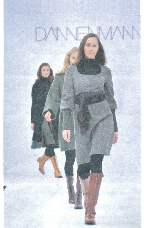
Looks from Dannemann Pure.